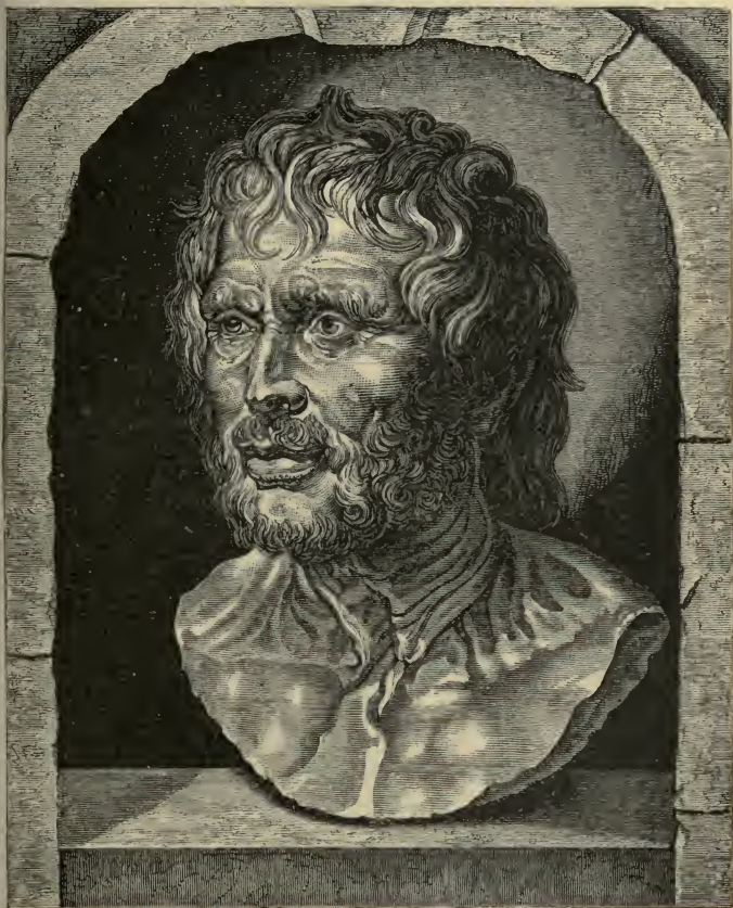
LUCIUS ANNÆUS SENECA.